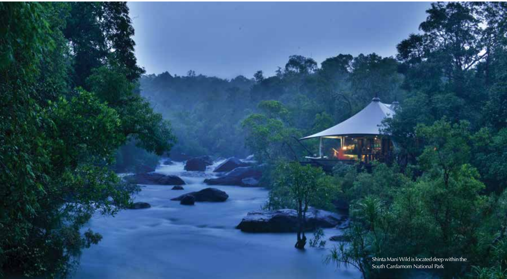
Shinta Mani Wild is located deep within the South Cardamom National Park

Adventure begins right from the start. Guests take a 380m zip-line to the property, touching down at the aptly named Landing Zone Bar where a warm reception and cool refreshments await. Those not keen on an adventurous entrance can opt for the conventional arrival by vehicle.