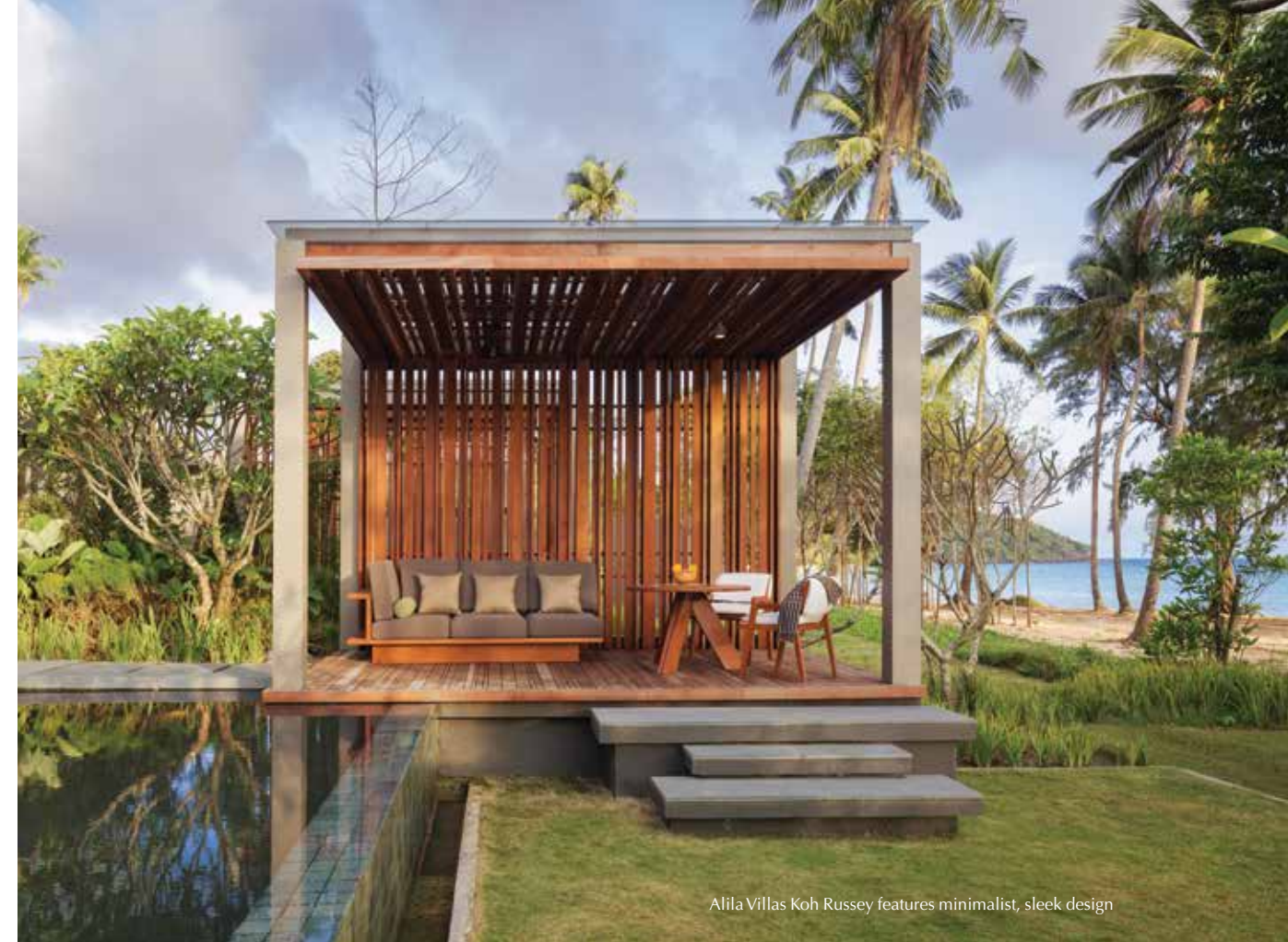
Alila Villas Koh Russey features minimalist, sleek design