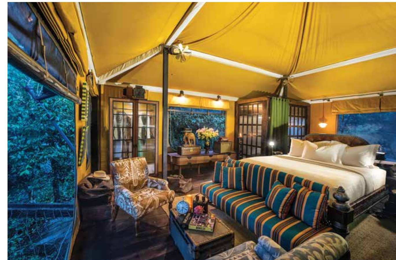
Shinta Mani Wild marries style with substance, protecting the surrounding habitat while offering guests chic luxury accommodation and jungle adventures