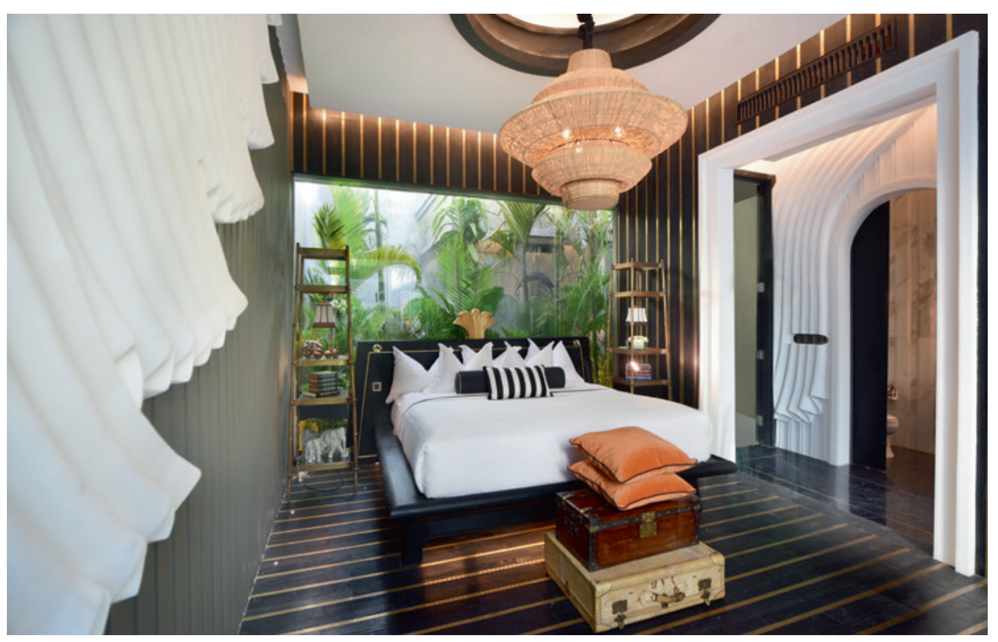
Above: Guestrooms feature a three-dimensional wall carving that portrays the rippling robes of a Khmer king

Yes, they can arrange a poolside BBQ or organise guided tours of nearby Angkor Wat, but it's the personalised, intuitive touches, such as remembering how you like your morning coffee, or magically appearing with a glass of freshly-squeezed fruit juice when in need of a pick-me-up that really sets them apart, bringing a new level of luxury to this part of the world.