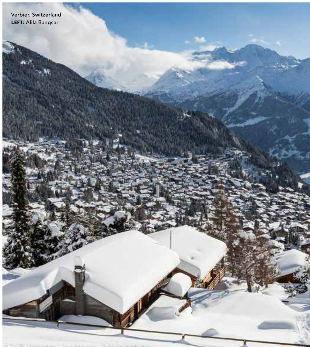
Verbier, Switzerland LEFT: Alila Bangsar

Bright, brilliant and a little bit brash, this young hotel chain's bold design is always a winner. But the key to this Scandi success? Beds for £110 in the notoriously steep Danish capital. citizenm.com