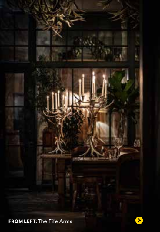
FROM LEFT: The Fife Arms