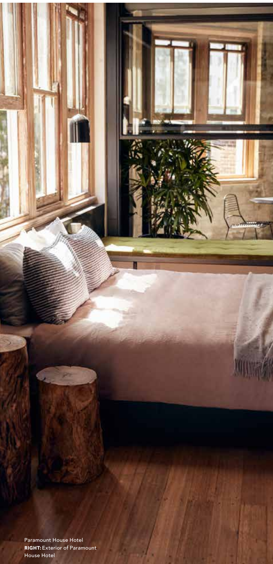
Paramount House Hotel RIGHT: Exterior of Paramount House Hotel