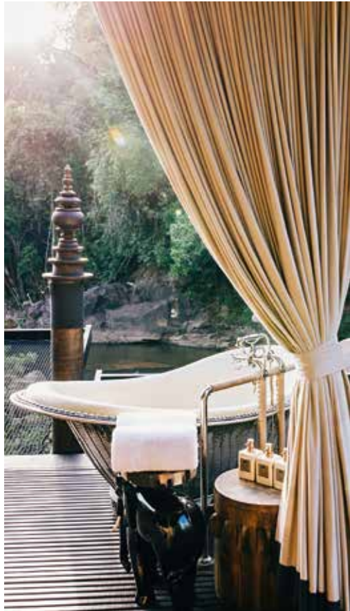
FROM LEFT: Shinta Mani Wild; Islas Secas Reserve & Lodge