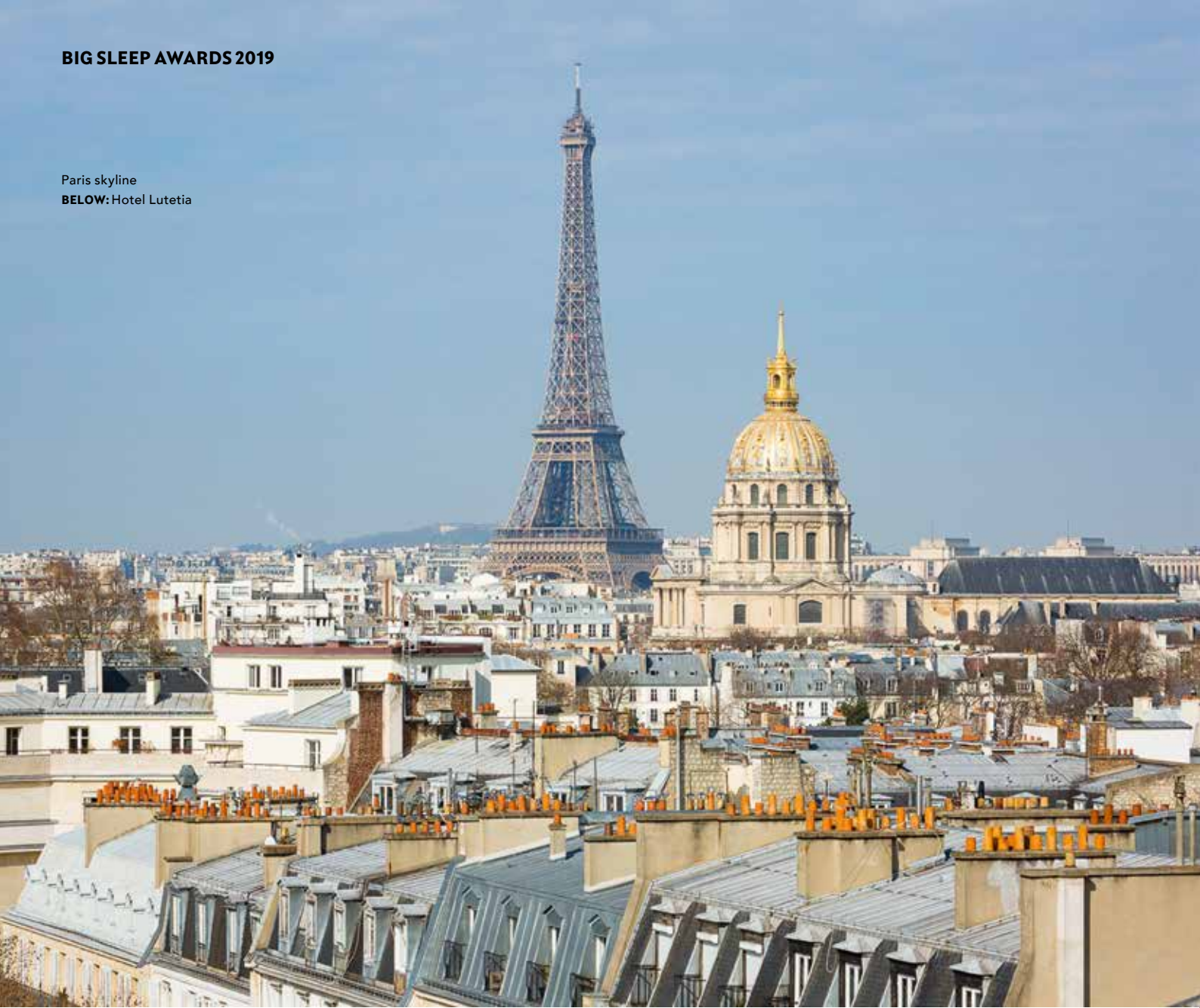
Paris skyline BELOW: Hotel Lutetia