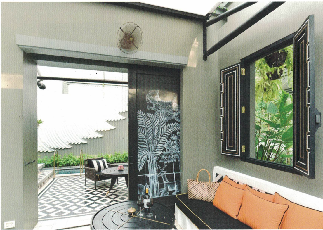
From top, a secluded rooftop terrace; Cambodian design meets the eclectic interior wizardry of Bill Bensley