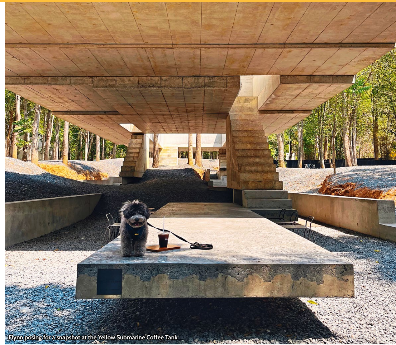
Flynn posing for a snapshot at the Yellow Submarine Coffee Tank

Constructed by Secondfloor Architects, Yellow Submarine Coffee Tank is a sight to behold. An architectural stunner, the pet-friendly