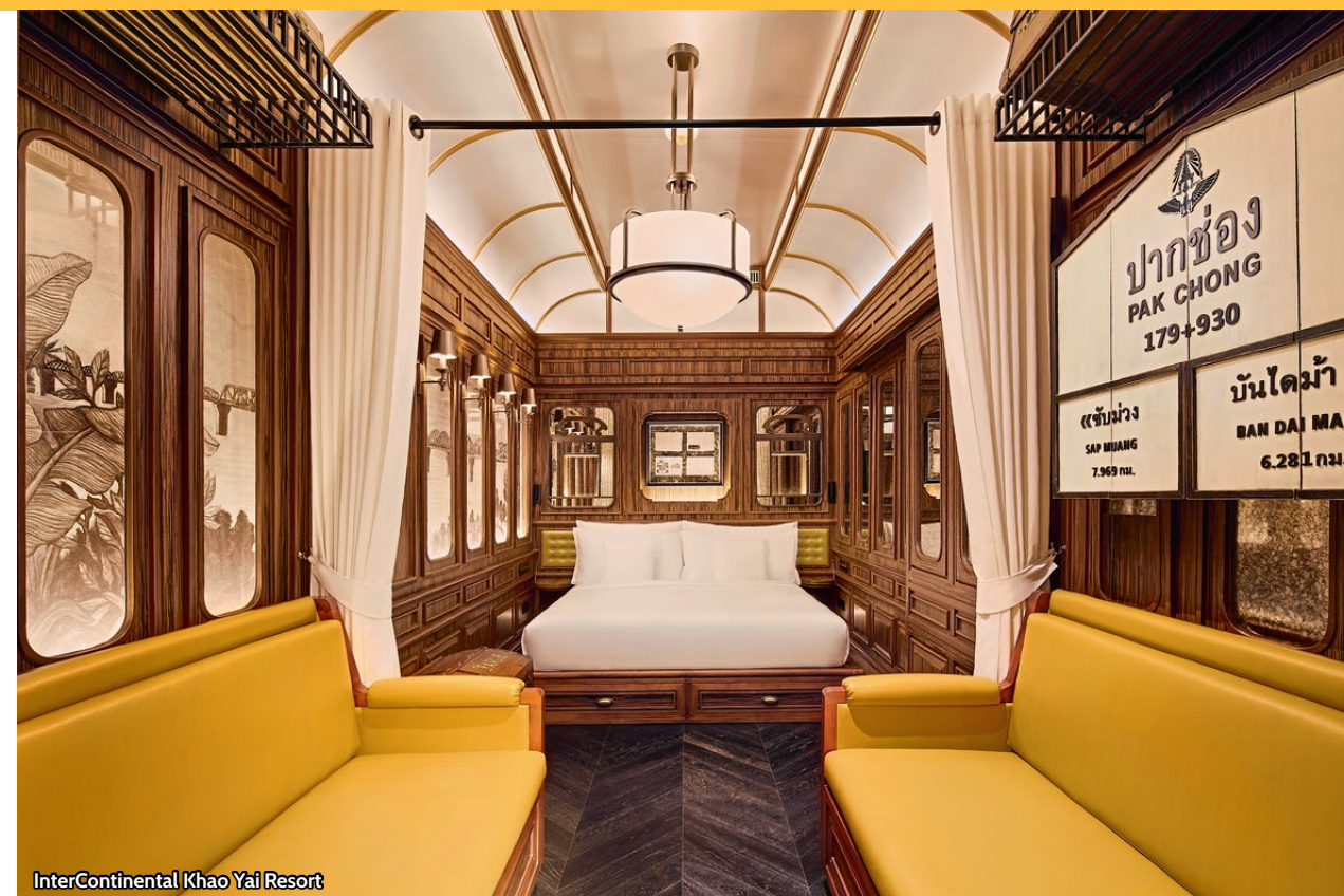
InterContinental Khao Yai Resort

Beyond its glamorous historic influences, the lush resort – spanning 19 hectares across Khao Yai National Park – is a reflection of the region's calm and an embodiment of its zen. Tranquil touches such as the Botanic Garden, Waterfall Edge, and Swan