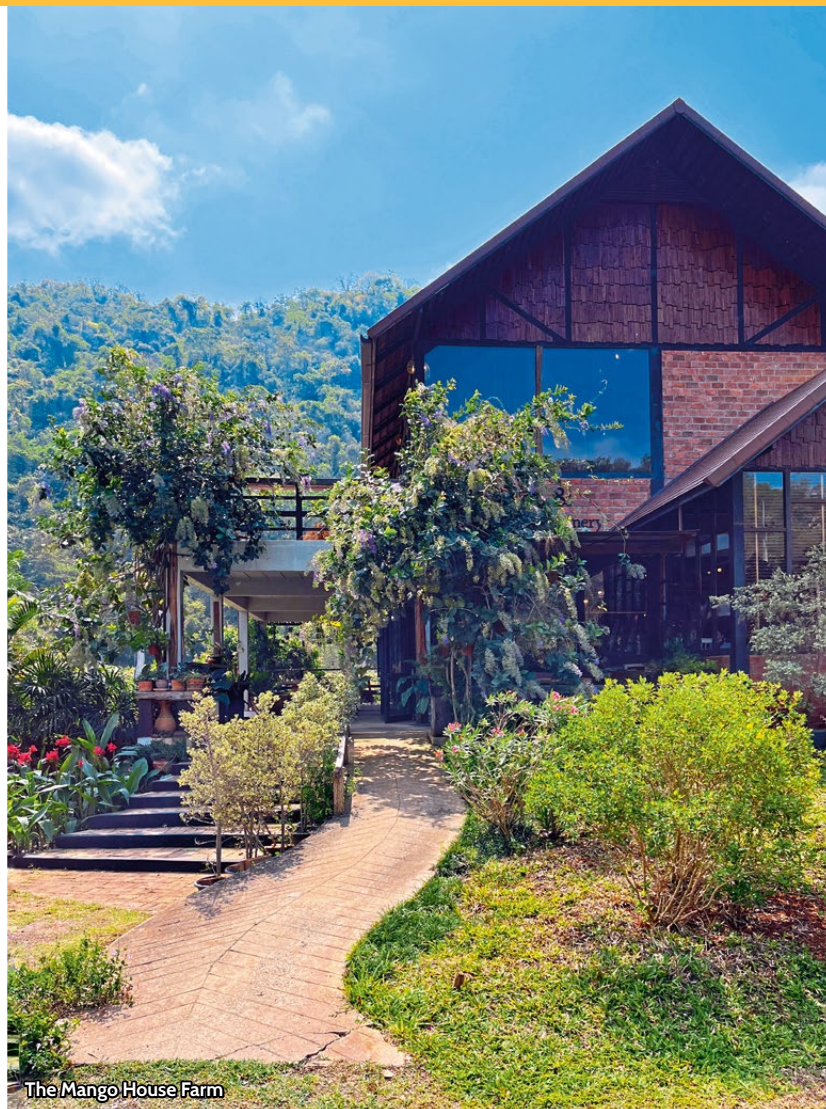
The Mango House Farm

Approximately 15 minutes away, Alcidini Winery has been operating for the last 30 years. Located on the hillside within the vicinity of the national park, the vineyard is located in a village called 'the swamp of Alcedo,' a