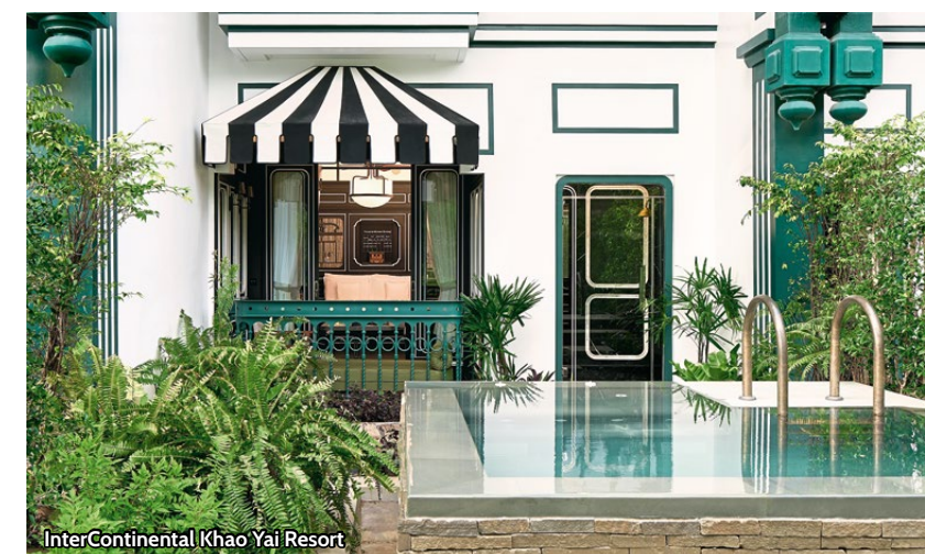
InterContinental Khao Yai Resort